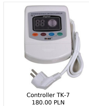
Controller TK-7 180.00 PLN