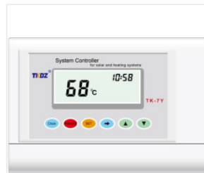
Controller TK-7Y 180.00 PLN