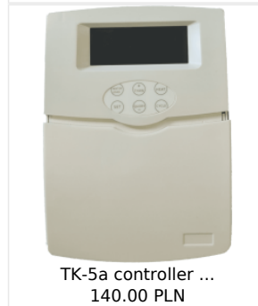
TK-5a controller ... 140.00 PLN