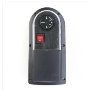
Thermostat with t... 85.00 PLN