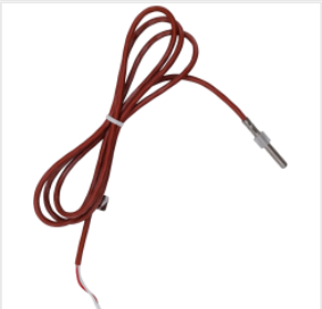
Temperature senso... 36.00 PLN