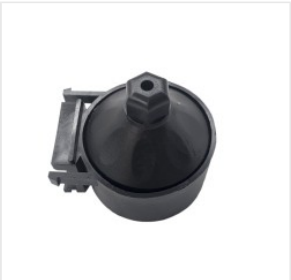
Vacuum Tube Holde... 3.50 PLN