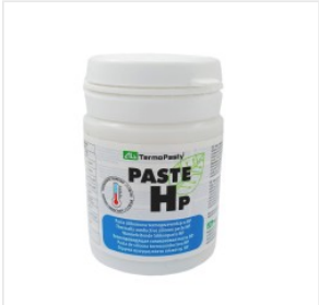
Thermal paste HP ... 40.50 PLN