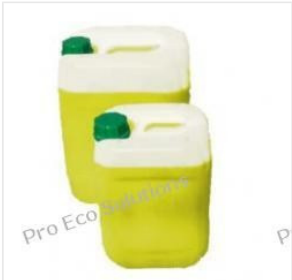
Fluid ECO MPG-SOL... 193.73 PLN