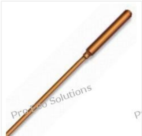
Heat Pipe 14(8)/1... 42.00 PLN