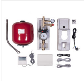
Solar Station (Pu... 2,100.00 PLN