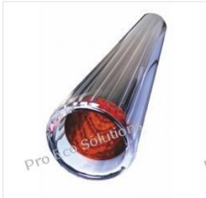
Vacuum tube 58/18... 48.00 PLN