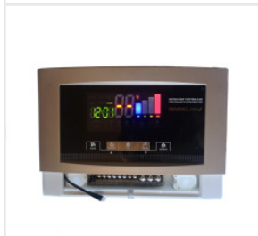
Kontroler Prophet... 180.00 PLN