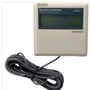
Controller SR868C8 450.00 PLN