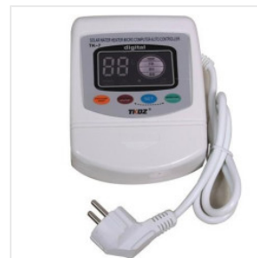
Controller TK-7 180.00 PLN