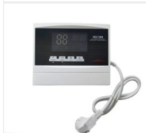
Kontroler HLC-388 175.00 PLN