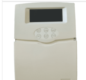
TK-5a controller ... 140.00 PLN