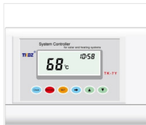
Controller TK-7Y 180.00 PLN