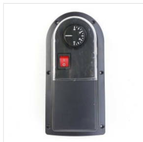
Thermostat with t... 85.00 PLN