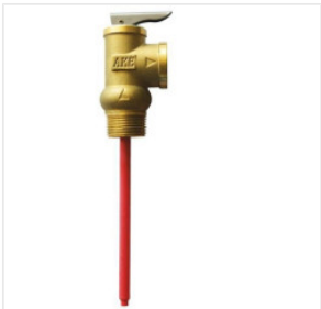
Temperature and p... 68.00 PLN