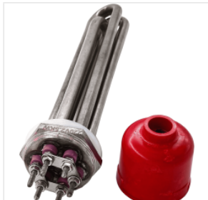
Electric heater 2... 67.00 PLN